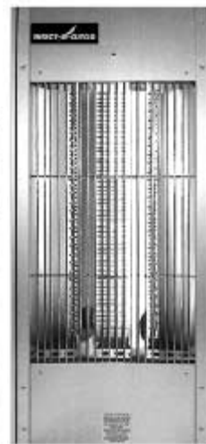
SERIES 9, SERIES 6/8, AND SERIES 11