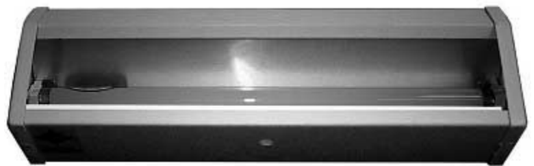
GUARDIAN® MODEL GB18

Guardian® Wall Mount Glueboard Fly Traps are ideal for areas where other insect control devices are inadequate or not allowed due to the proximity of open foods and food preparation areas.